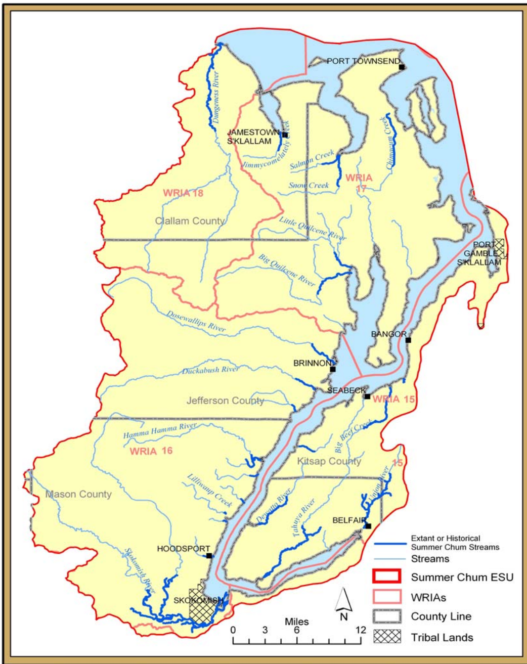
Figure 1. Hood Canal/Eastern Strait of Juan de Fuca Summer Chum Salmon Recovery Planning Area. (from Figure 2, p. 5 of the Hood Canal Summer Chum Recovery Plan, Map developed by Gretchen Peterson, PetersonGIS.)